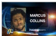
University Of Iowa Football Player Arrested For...