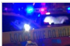
Off-Road Motorcycle Crash Kills One