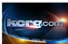
Three Middle School Football Players Face Charges...